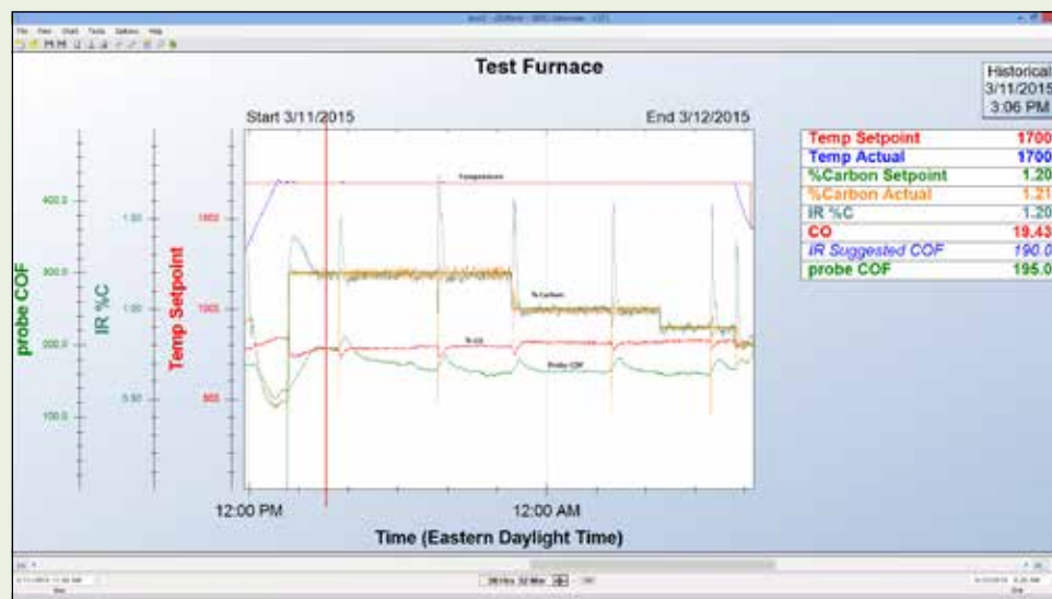
Figure 1: Deep case-carburizing cycle using in-situ probe with continuous NDIR three-gas analyzer to alter carbon calculation by periodically adjusting the COF in the control instrument. Variations in atmosphere allow for the analyzer to adjust in-situ control.

To maximize quality, steps must be taken in all heat treating processes to ensure that time, temperature, and atmosphere are not compromised. A good example is carburizing in a gas atmosphere to provide an effective case hardness and depth. An oxygen probe is used for in-situ monitoring of the furnace atmosphere, measuring the “lack” of oxygen in the atmosphere. This calculation uses an EMF (in millivolts) generated by the probe, which is created by the partial pressures of oxygen, carbon monoxide (CO), and temperature to calculate the percent carbon available to the surface of the workpiece. For carburizing, the atmosphere must be rich in carbon and at a suitable temperature to allow carbon to